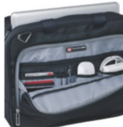
interior padded laptop compartment