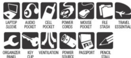
ORGANIZER PANEL KEY CLIP VENTILATION POWER SOURCE PASSPORT PENCIL STALL