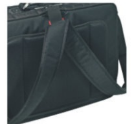
revolutionary two-to-one shoulder strap system