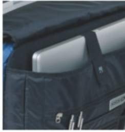
padded top drop-in laptop sleeve