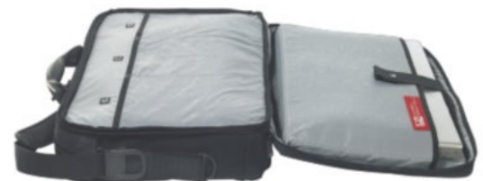
lays flat for screening