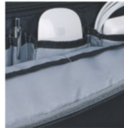
padded mouse/digital camera pocket