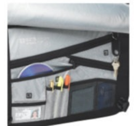
large organization panel